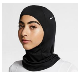
Nike Pro Hijab

Neck coverings approved in all categories, Nike and Adidas only