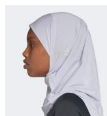
Adidas Sport Hijab